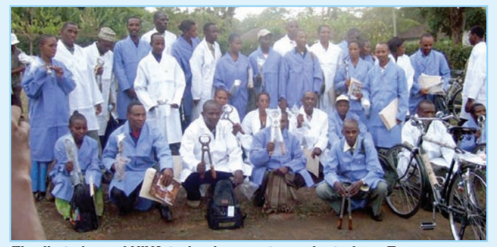
The first class of VIVA-trained paravets graduate from Tengera College. The training of these paravets would not have been possible without the support of Irish Aid ( \in 50,000) and Electric Aid ( \in 10,000). Electric Aid is the staff social justice fund of ESB employees which funds development projects in Ireland and abroad.

While in Tanzania, the VIVA team attended a ceremony at Tengera Agriculture College at which the first 30 CAHWs trained under the scheme graduated. They were also presented with basic equipment kits and bicycles to facilitate their work.